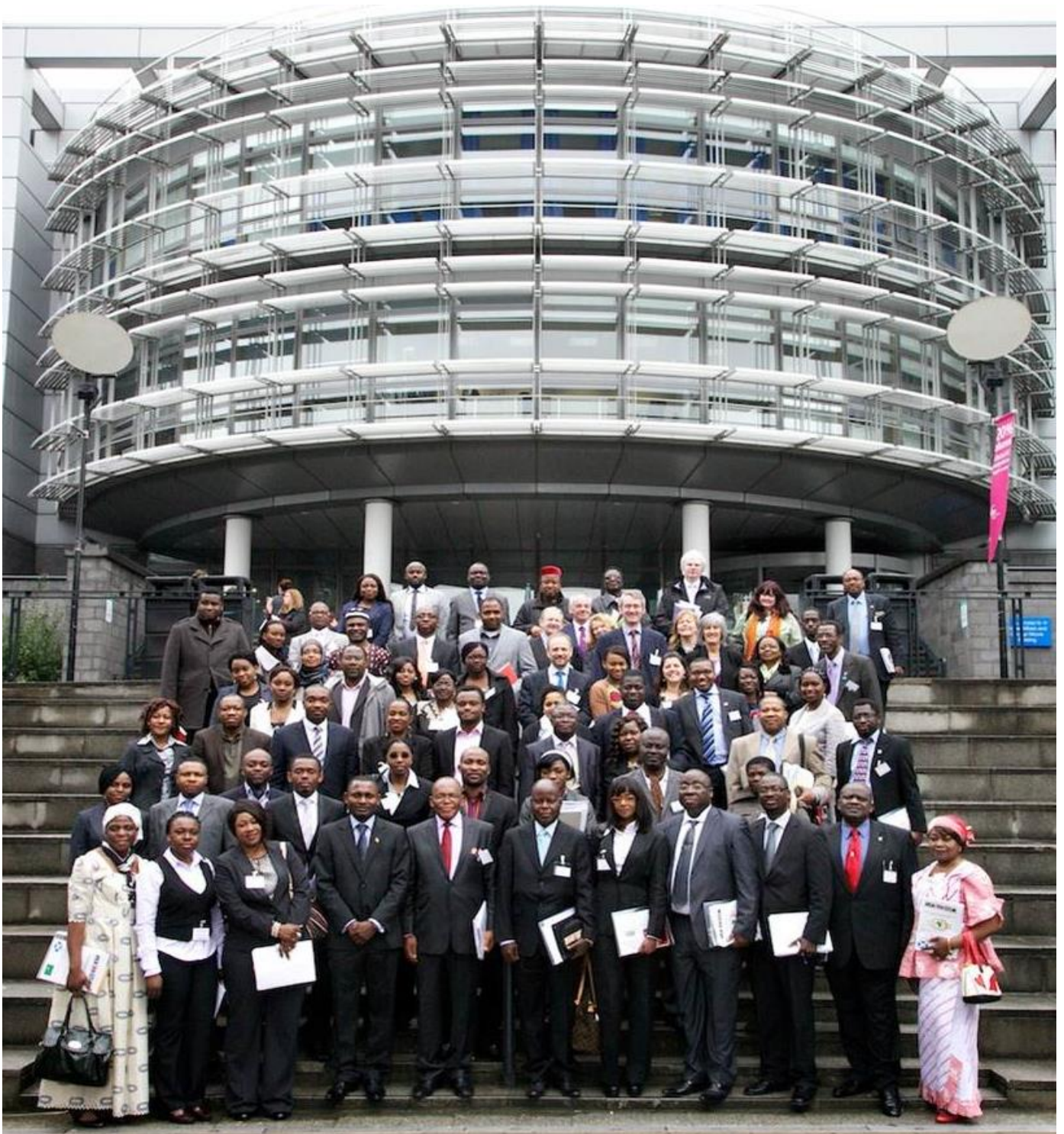
Delegates on day one of The Annual Scottish African International Business Conference & Exhibition 25-26 April 2013