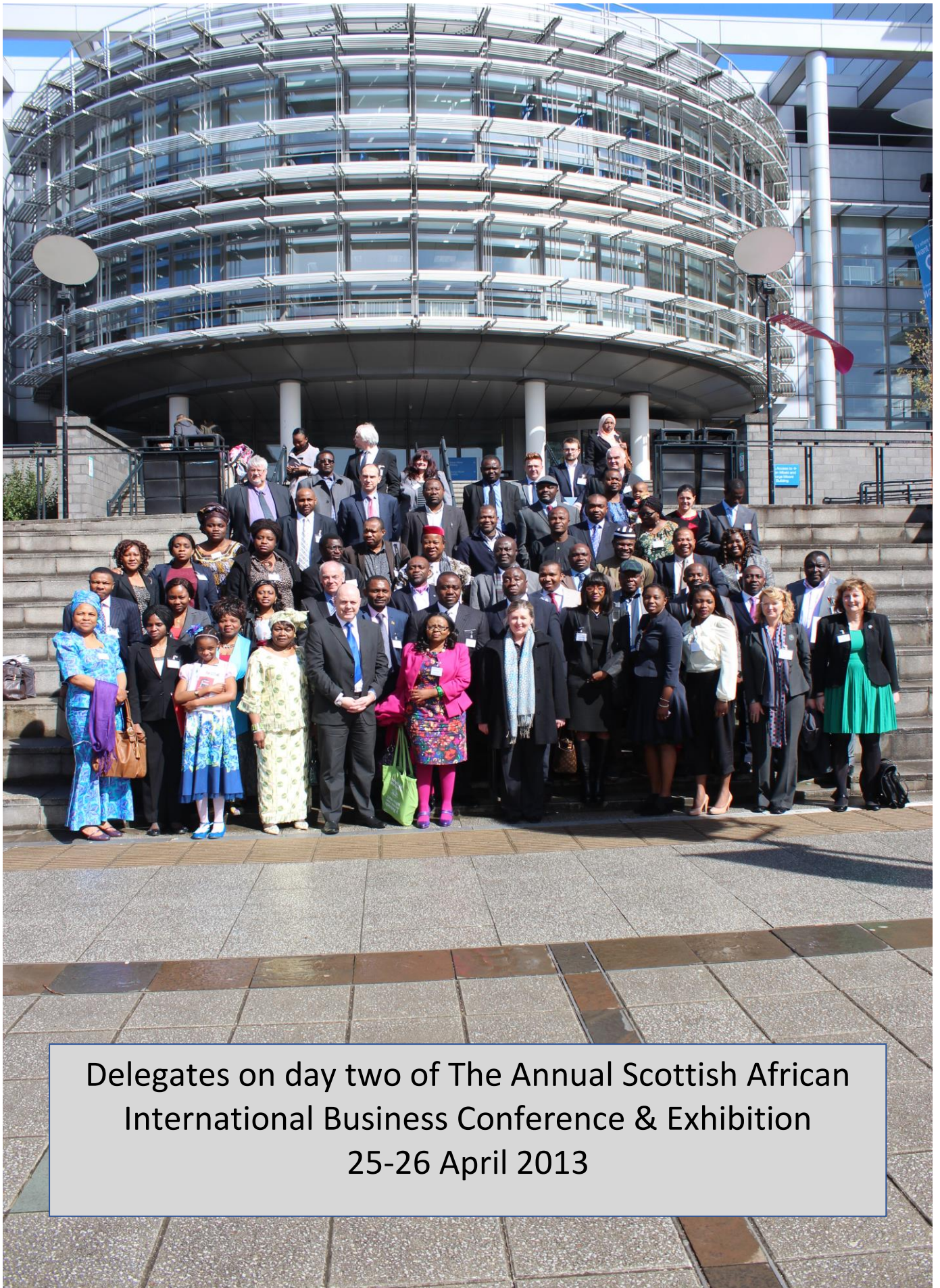
Delegates on day two of The Annual Scottish African International Business Conference & Exhibition 25-26 April 2013